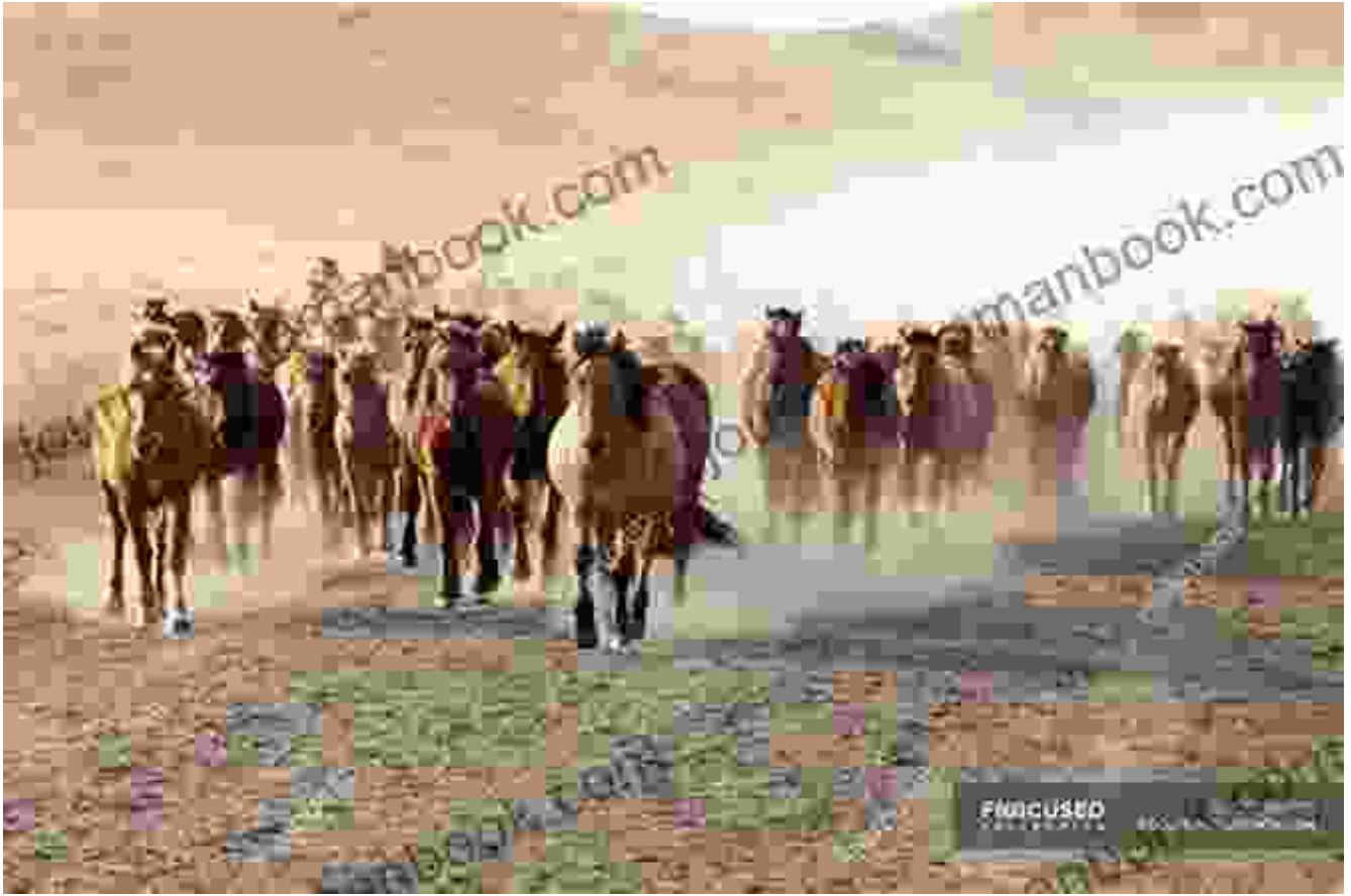
A herd of wild horses running through the Mongolian steppe.